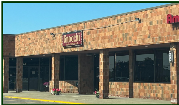
2,400 SF Restaurant