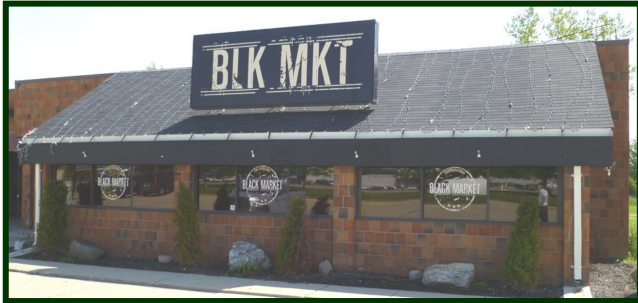
5,200 sf Turnkey Restaurant/Bar