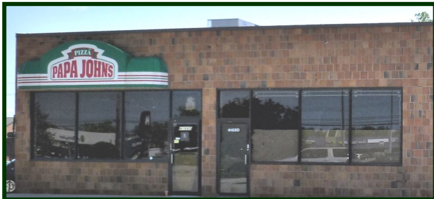
1,600 sf (20'x80')